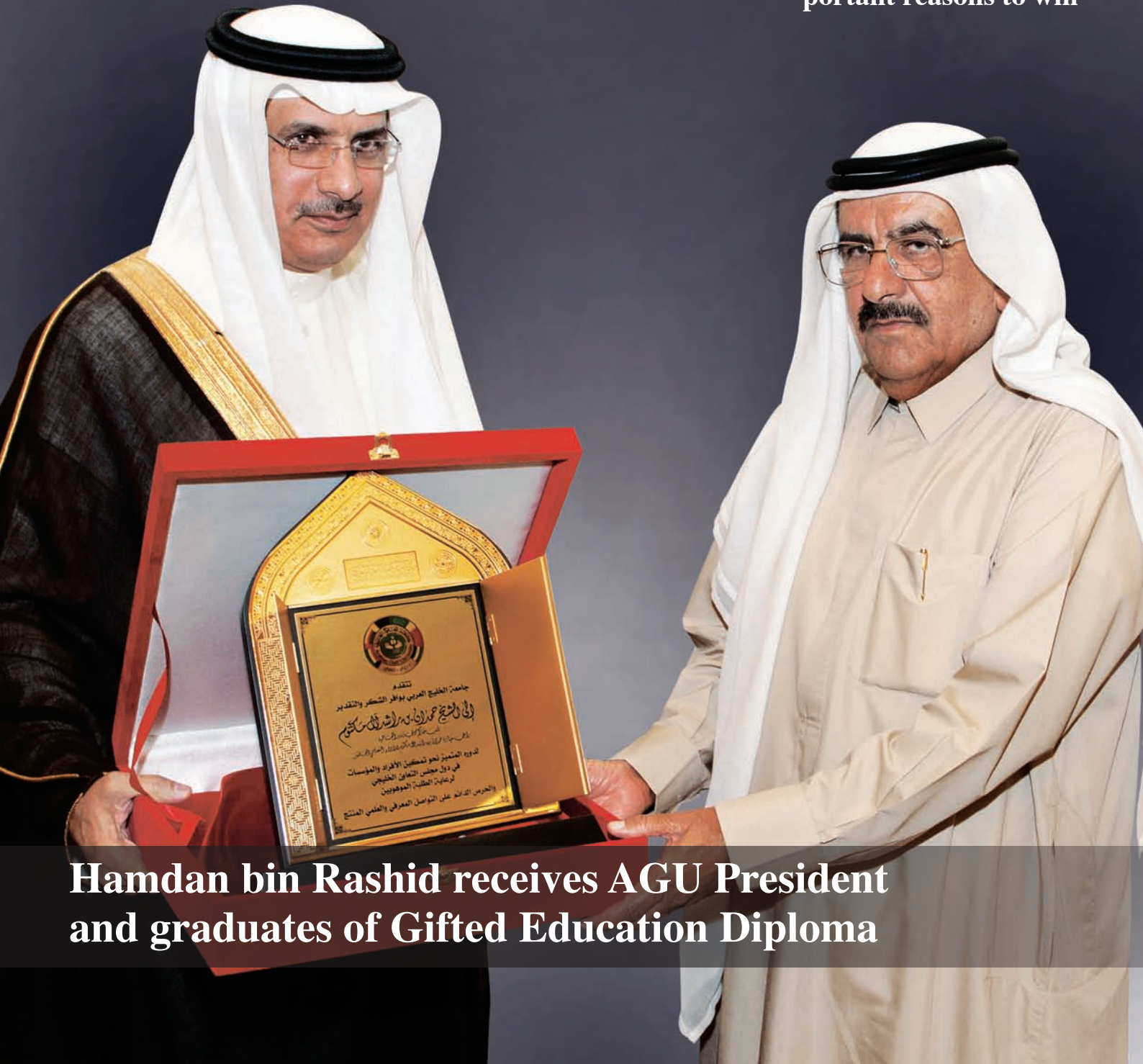
Hamdan bin Rashid receives AGU President and graduates of Gifted Education Diploma

Adjudicators: Commitment to criteria and acknowledgment of experiences are the most important reasons to win